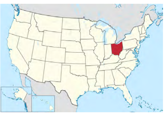
Location of Ohio in United States map.

Eventually the land became some of the most fertile to be farmed in the Mid-West and became associated with the Miami and Erie Canal for transportation of people and farm commodities.