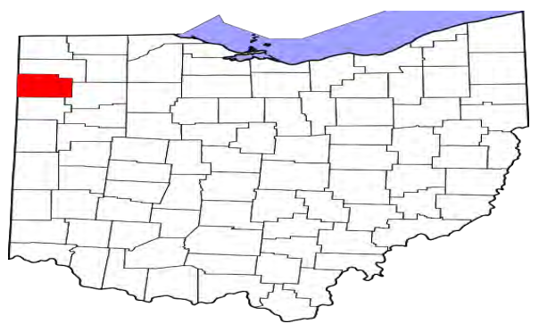
Location of Paulding County in Ohio map.

In 1853, William purchased 60 acres of land from the government in Paulding County, Ohio. He paid $1.25 per acre. The land purchased was called the 'Black Swamp.' The swamp was so difficult to travel that wheeled transportation was impossible during most of the year, and travel 'suitable only for adult men.' In the 1850's an organized attempt began to drain the swamp for agricultural and travel (only a task the Irish would entertain!).