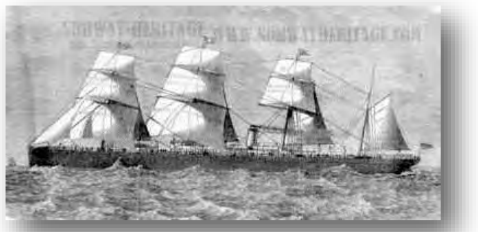
The S.S. Atlantic.