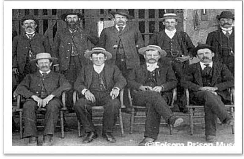
Folsom Prison Guards – Circa 1900. Used with permission of Folsom Prison Museum at http://www.folsomprisonmuseum.org.

When he was older, he spent time at San Quentin State Prison for second degree burglary and then Folsom State Prison for committing the same crime.