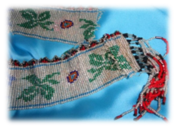
Enlarged photo of beaded headband created by Piedad Mary Rivas-Garcia. You can clearly see the intricate details.