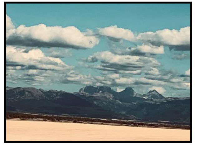
The view from the Rudolph Family homestead across the valley looking at the Grand Tetons.

stones there that we could find. Then we walked up to the old homestead where there were two broken down barns and the remains of a two room house, all overlooking the valley with the Grand Tetons in the eastern background. It was amazing and beautiful. A gorgeous day with blue skies and puffy clouds.