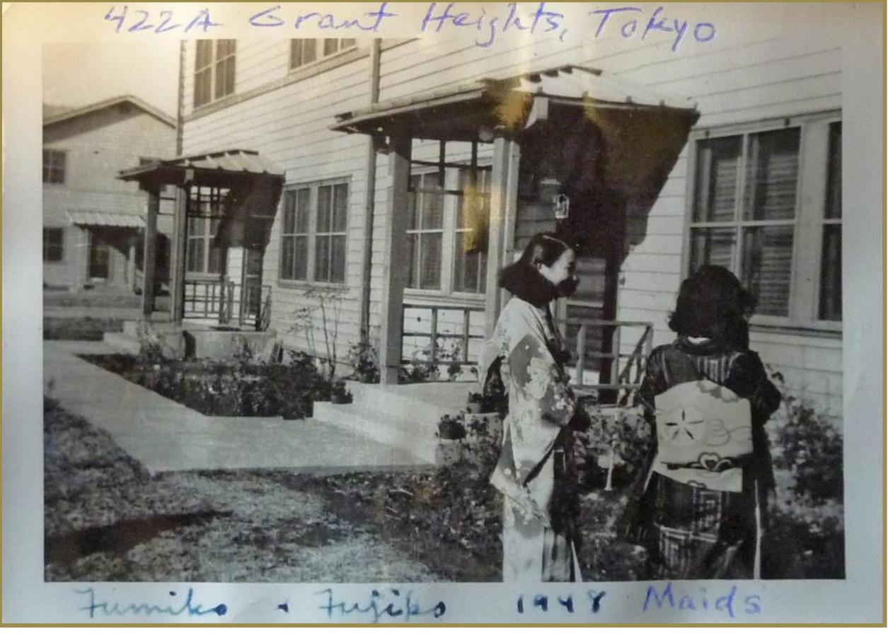
Housing in Grant Heights, Tokyo

<sup>2</sup>On the 16th of February 1948, Tokyo American High School, Narimasu was opened at Grant Heights Housing Area. It provided schooling for students 7th through 12th Grades who lived in the Tokyo metropolitan area. There were 201 students enrolled. A new housing area, Mutsumi Dai was built next to Grant Heights.