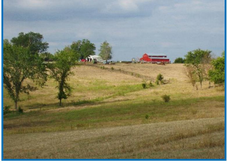
House and barn taken from cemetery showing distance from road.

<sup>2</sup>The Sutro Library is located on the 5th floor of the J. Paul Leonard Library, San Francisco State University