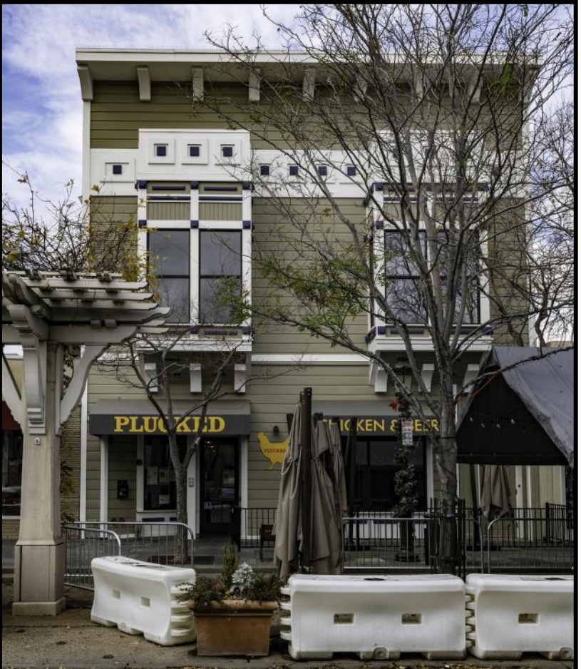
Marx Rosenthal Building

From a genealogical viewpoint I am always interested in who these people were. Where did they come from, did they have families, how long did they stay in town, do they have descendants here now? What were their full names? Sometimes it is fairly easy to figure out who these people were. We use online census records,<sup>1</sup> death records,<sup>2</sup> local church records, Historic Resources Inventory City of Livermore , Bunshah newspaper index, L-AGS website,<sup>3</sup> Tri-Valley Directory of Historical