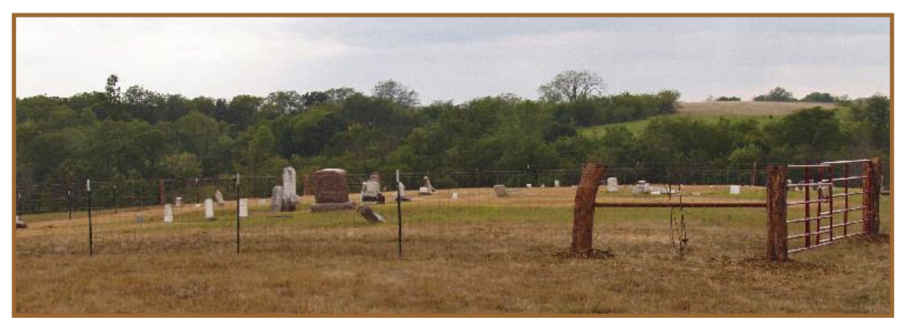
McClary Cemetery showing fence and gate.