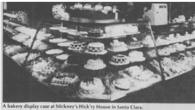
A bakery display case at Stickney's Hick'ry House in Santa Clara.

It wasn't a Lyon's or Denny's... it was different-- older and more "vintage". I barely remember the décor other than the maroon booths, but I remember the cakes and pies as you entered. And the waitresses that I think had worked there since it opened in 1953. As a child, I remember eating there as much as at any other restaurant. I don't remember any particular times but I know I always ordered a burger or the chicken soup. The burgers were delicious, large and predictable. The barbecue sauce was super smoky and tangy (more sweet than anything) and the chicken soup had thick, doughy noodles that made it more like a wet casserole than a soup. And the cakes and pies... oh dear lord the cakes and pies.