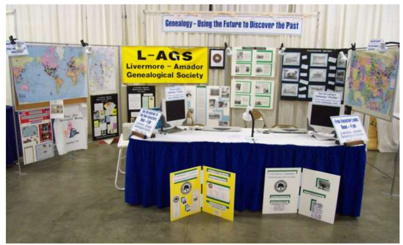
Alameda County Fair