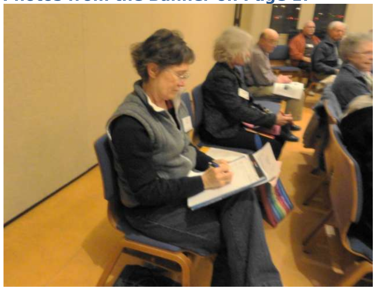
L-AGS Recording Secretery, January 2014