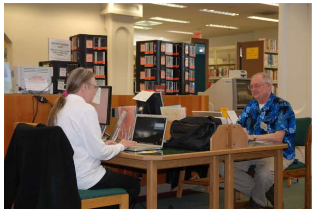
Pleasanton Library 2009