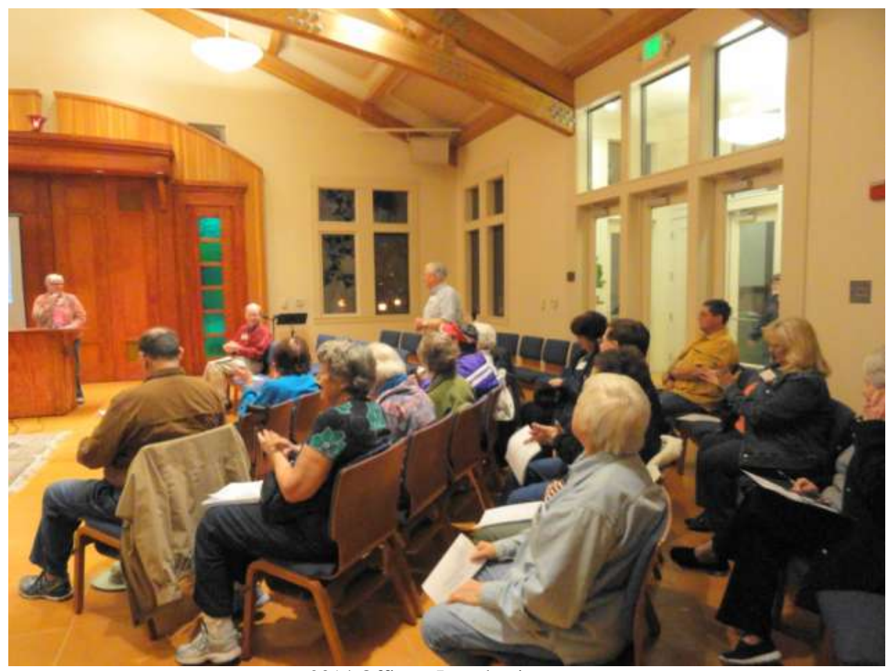
2014 Officers Introduction