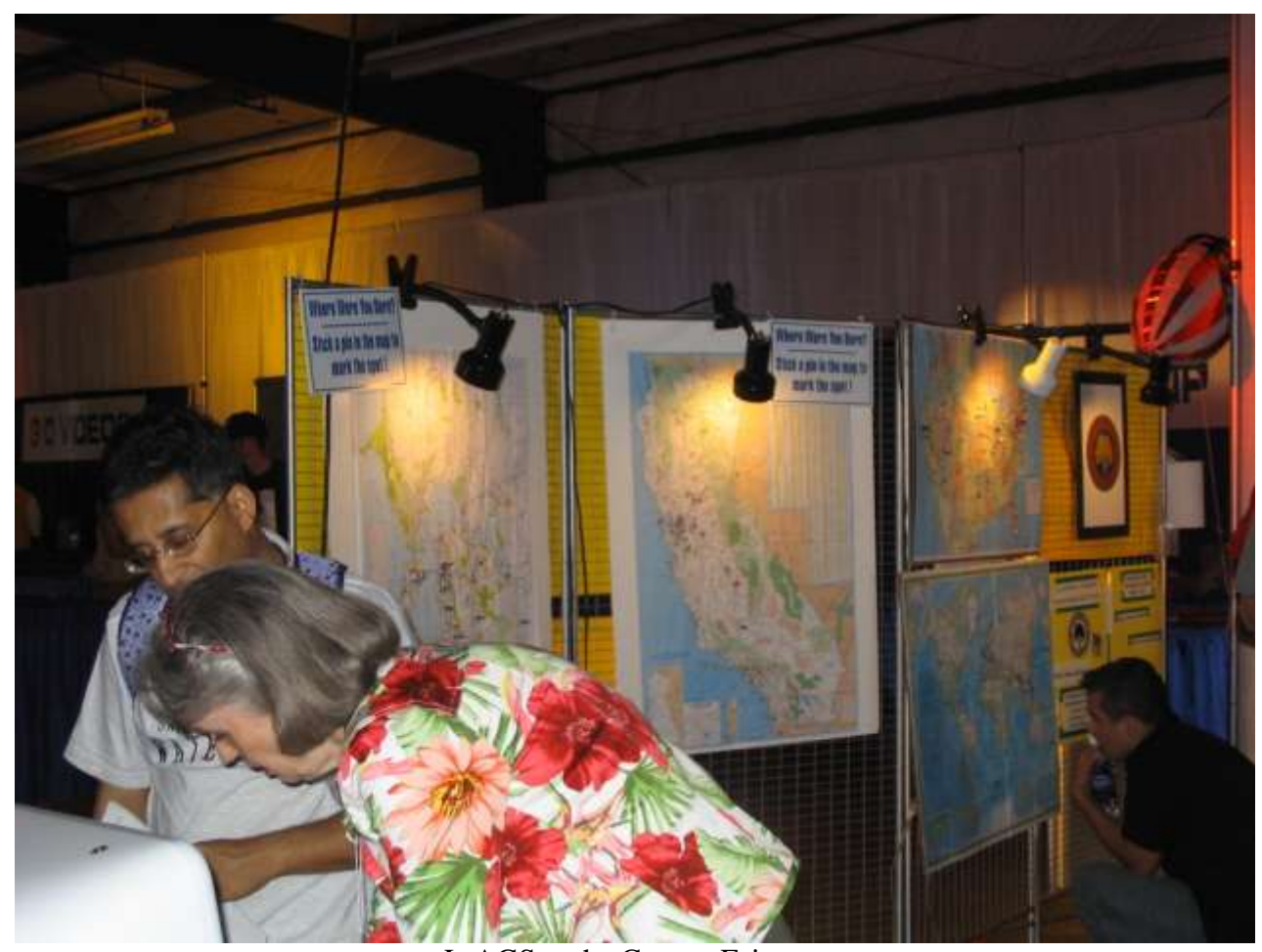
L-AGS at the County Fair