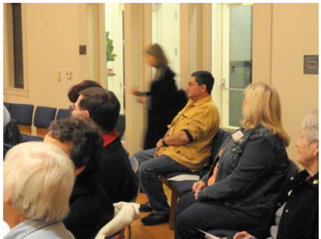
2014 Officers Introduction