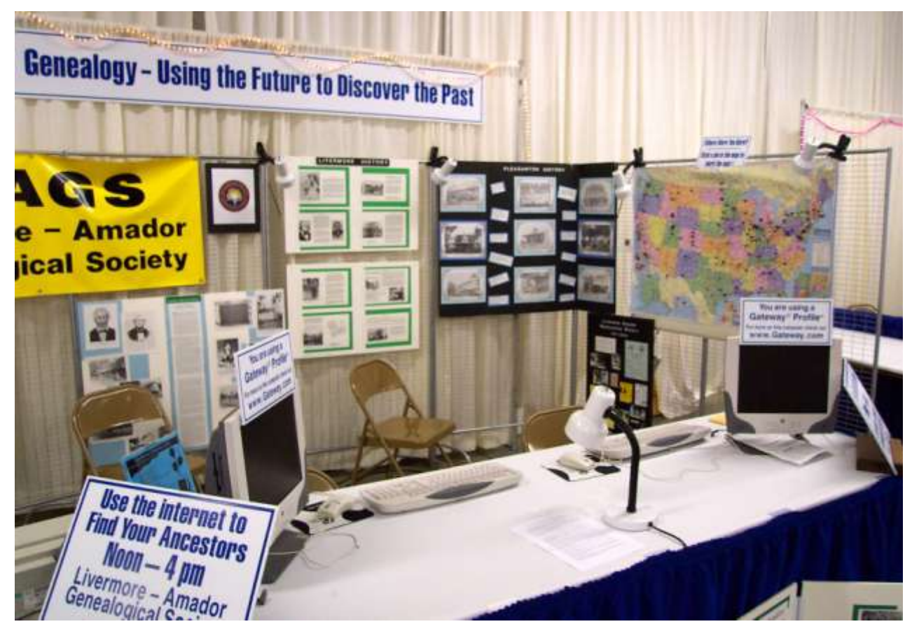
L-AGS at the County Fair