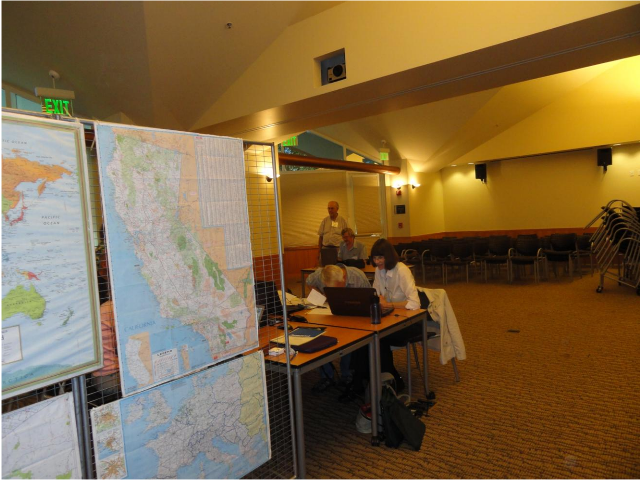
Livermore Library 2012 Heritage Happenings