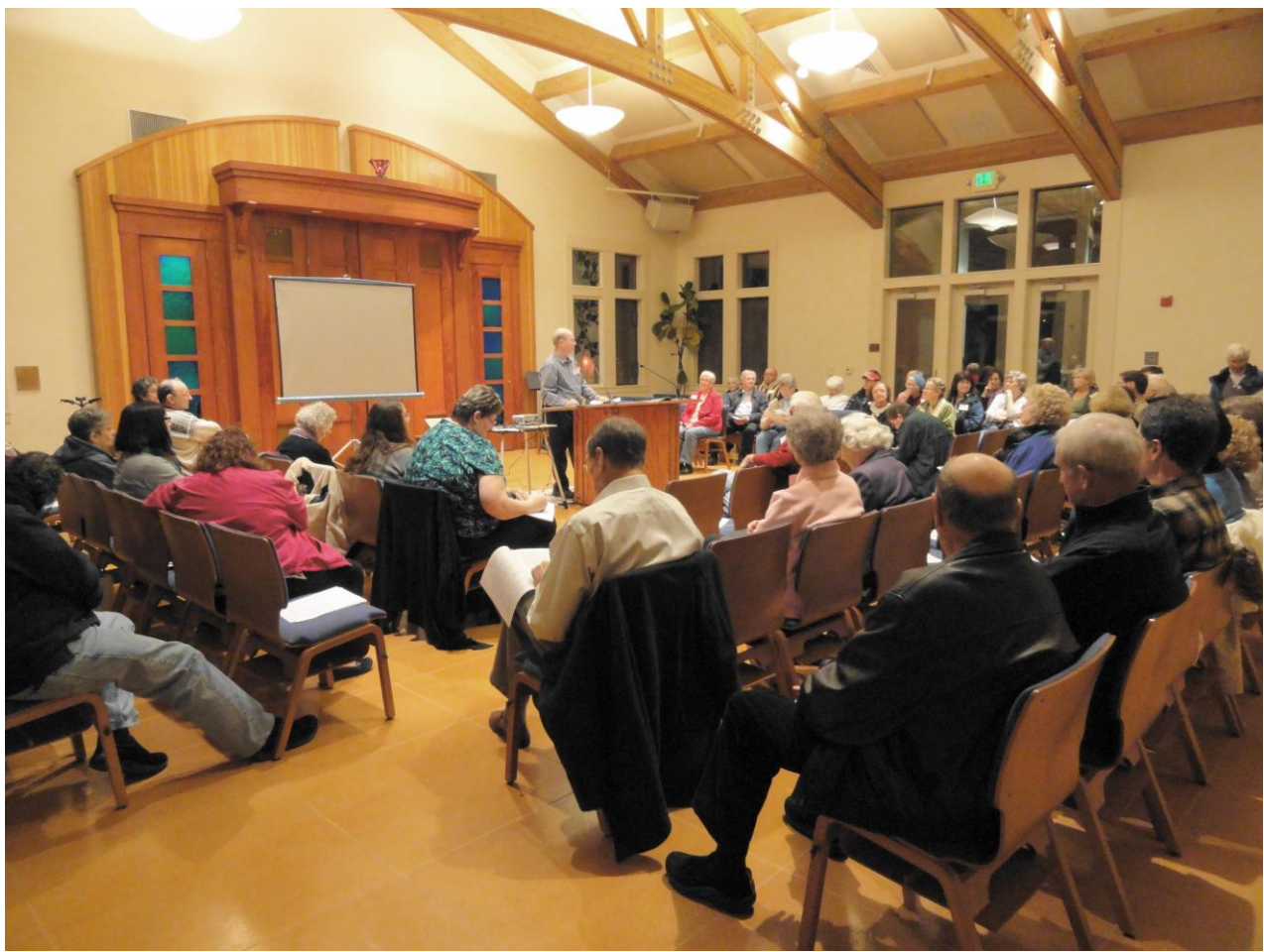
L-AGS Meeting, February 2013