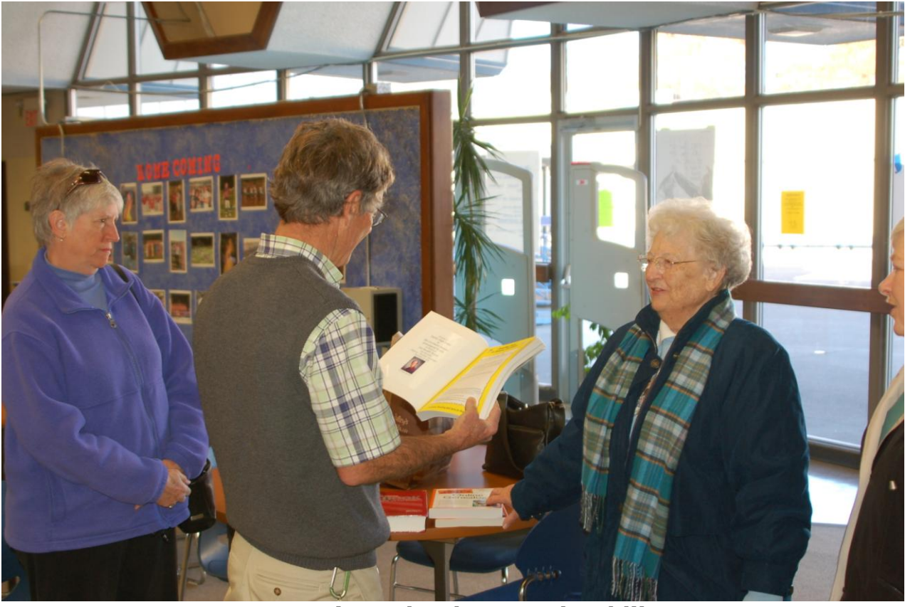
2007 Presenting a book to a school library