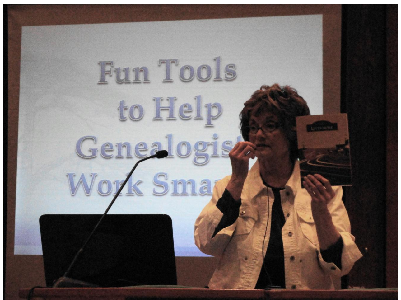
New Livermore Historical Book, March 2013