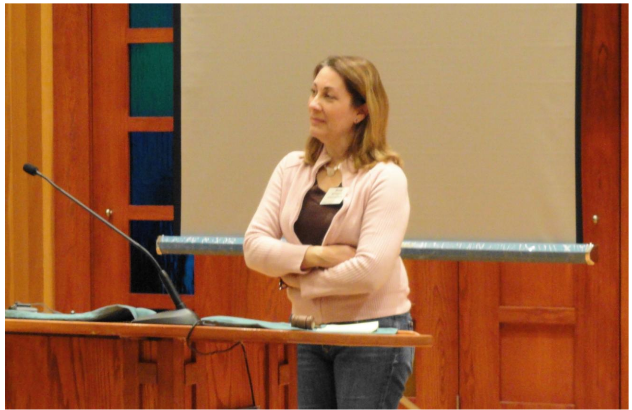
Membership Report at the L-AGS February 2013 General Meeting