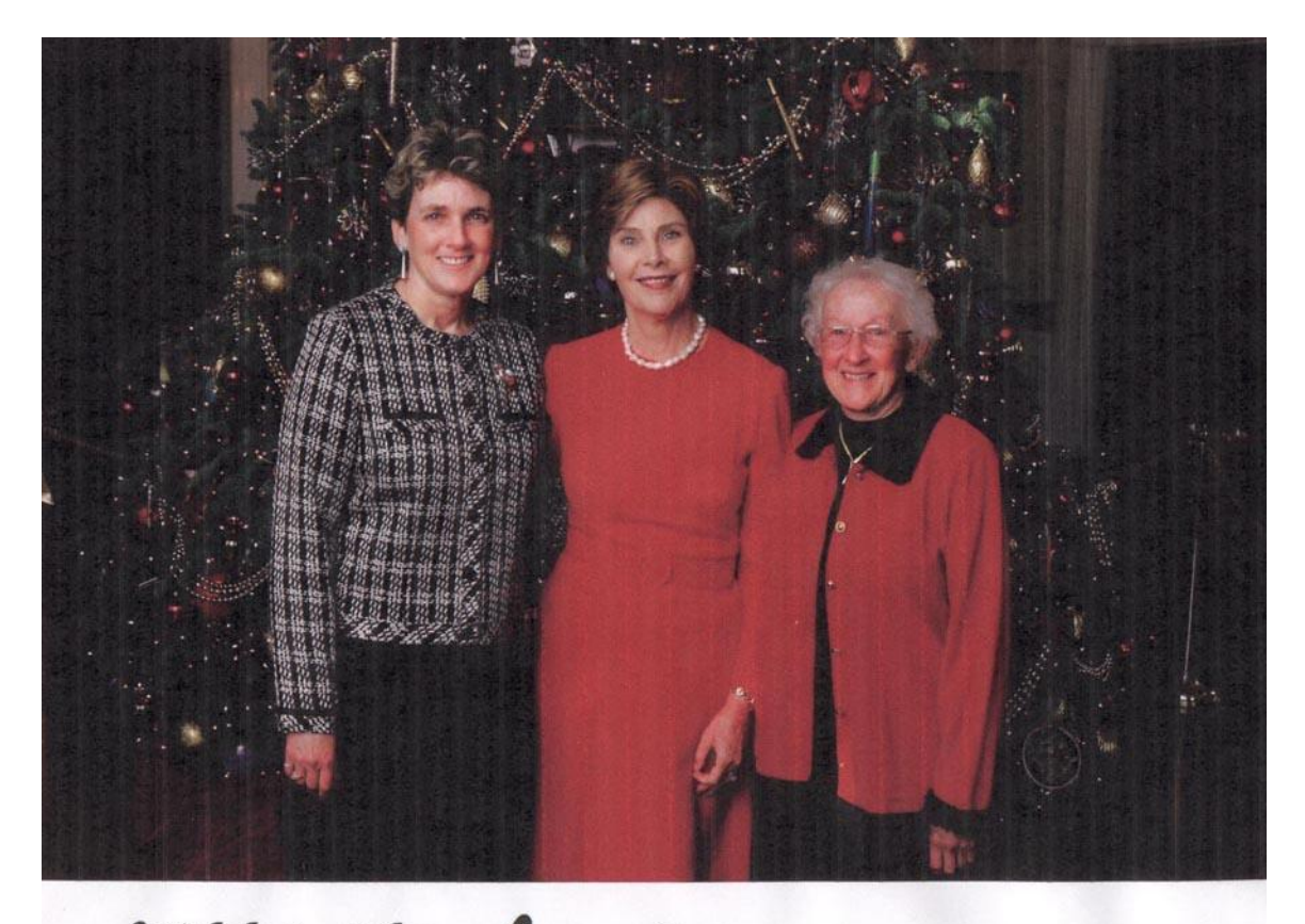
With best wishes, Leve But