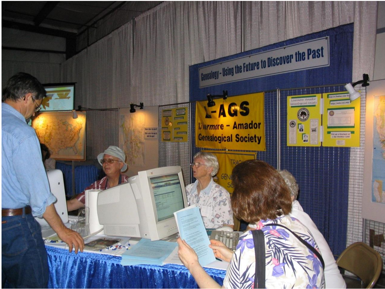
Alameda County Fair