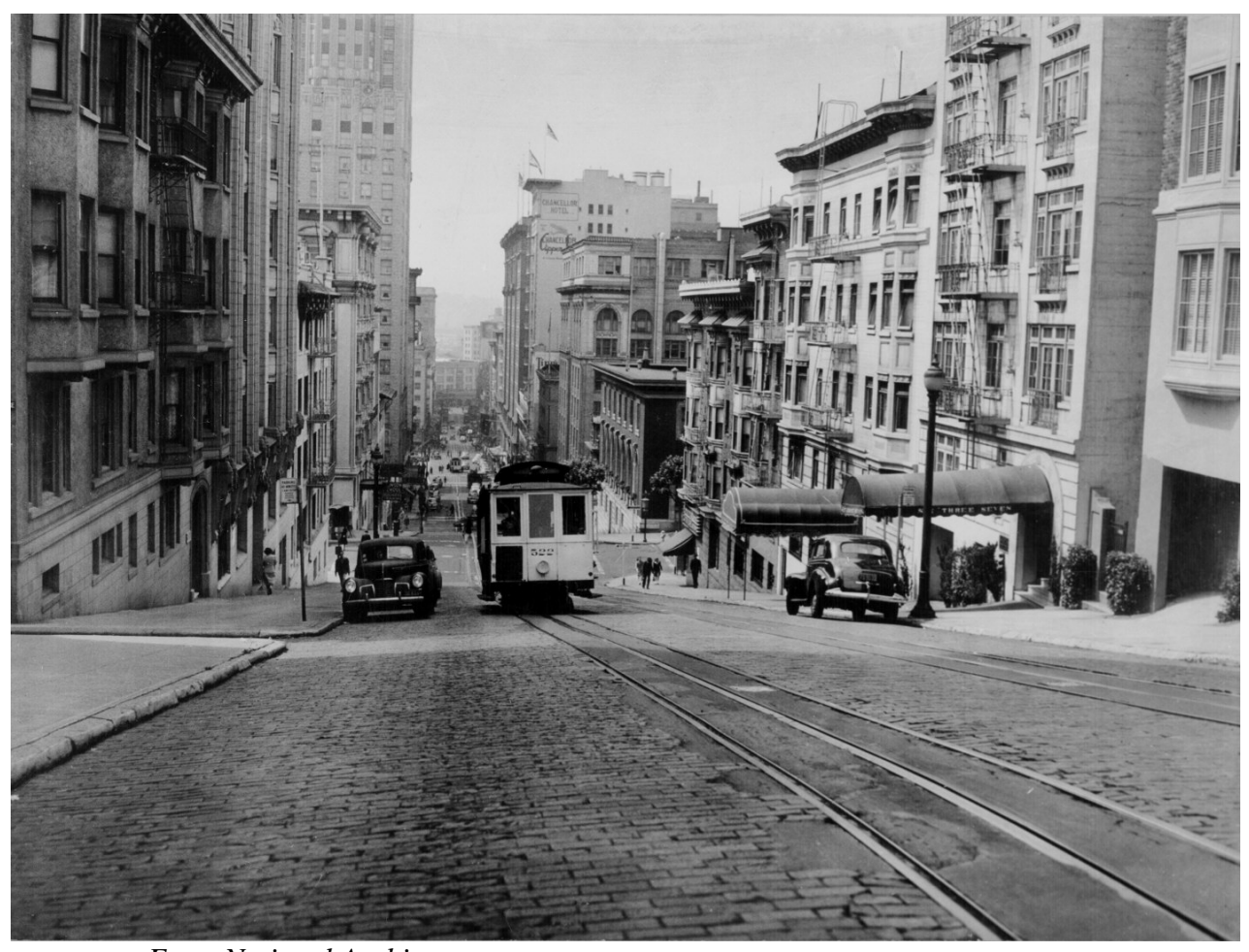
San Francisco's cable cars climbing the Powell Street hill, ca. 1945 ARC Identifier 535921