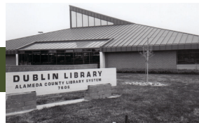
Deluxe Dublin March 21, 1979 7606 Amador Valley Blvd.