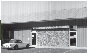
Big Dublin March 1, 1970 6900 Village Parkway