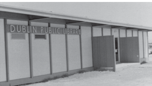
Little Dublin April 9, 1966 8101 Vamac Road

On front: The first Dublin Library opened on May 21, 1914 in the Green Store.