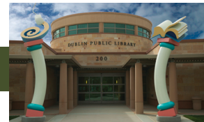
Modern Dublin April 12, 2003 200 Civic Plaza