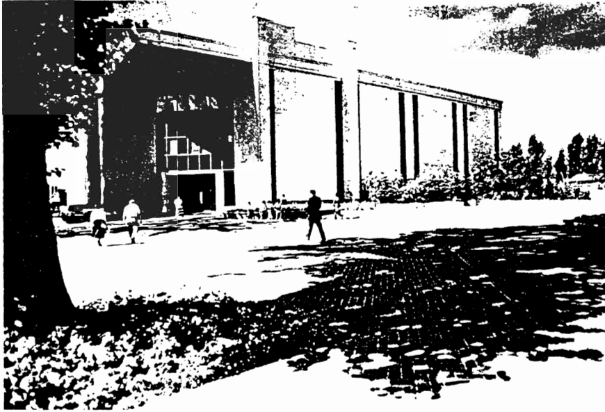
The Family History Center in Salt Lake City

would-be hajjis to the Mecca of genealogy, the LDS Family History Library in Salt Lake City. The author is a well-known genealogical writer, professional librarian, founder and volunteer director of the Modesto LDS Family History Center, and experienced director of group genealogical trips to Salt Lake City and Washington, DC.