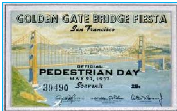
Pedestrian Day Souvenir

bridge due to the crowds of people surrounding her. She never got too close to the railing as she