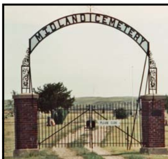
Midland Cemetery entrance