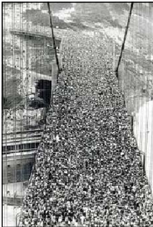
More than 200,000 people walked on the Golden Gate

bridge due to the crowds of people surrounding her. She never got too close to the railing as she