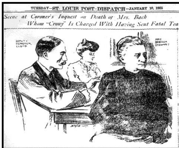
Coroner's Inquest Report

But my father's side of the family also had their share of family stories that were never passed down.