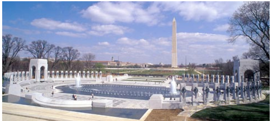
The Memorial Plaza of the Monument on the Washington Mall, a site dedicated to World War II Honorees.