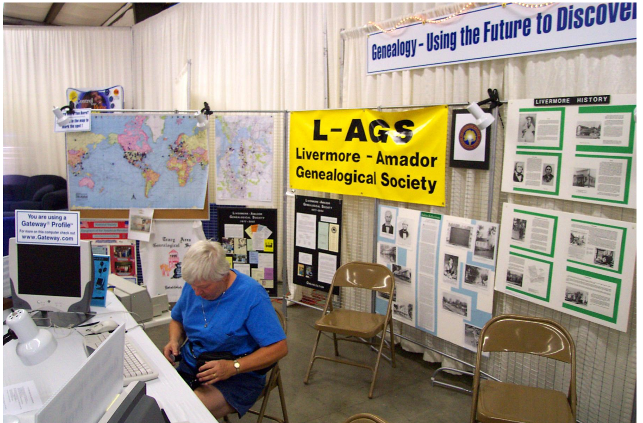
July 1995, Alameda County Fair