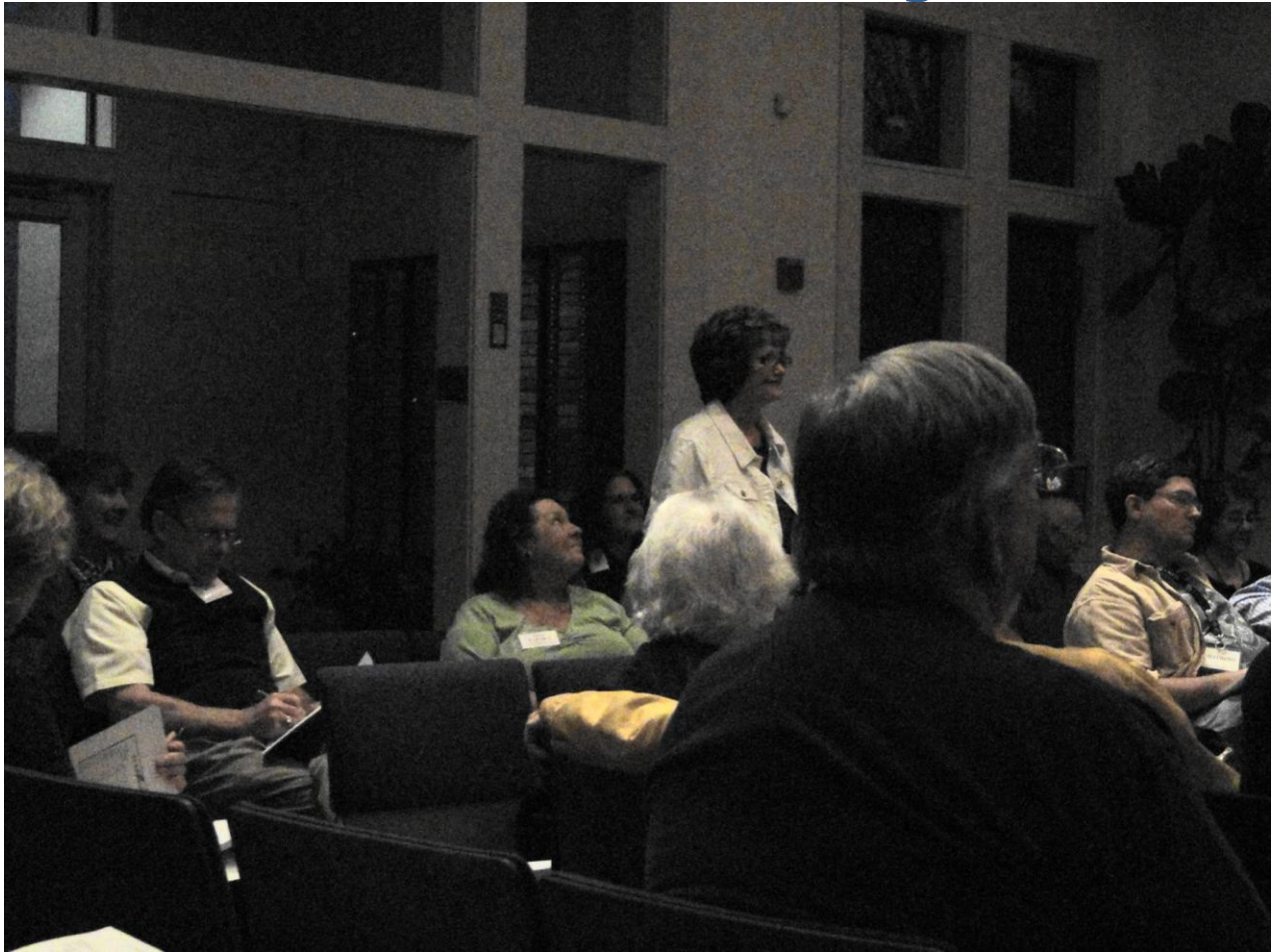
General Meeting, March 2013.