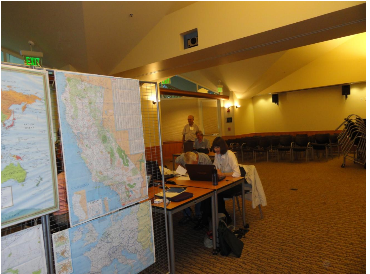
Livermore Library 2013 Heritage Happenings