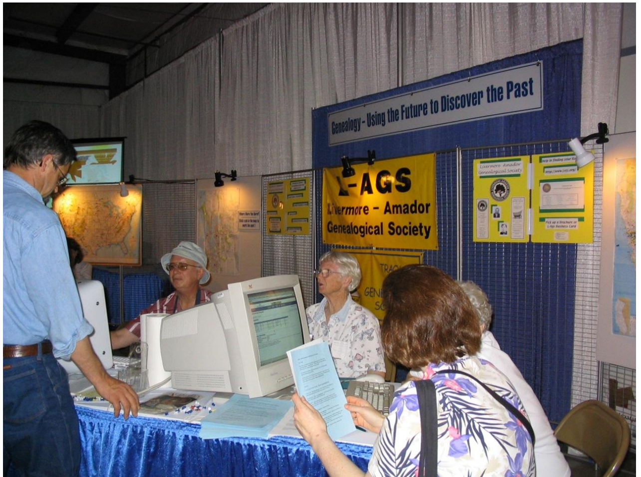
Alameda County Fair