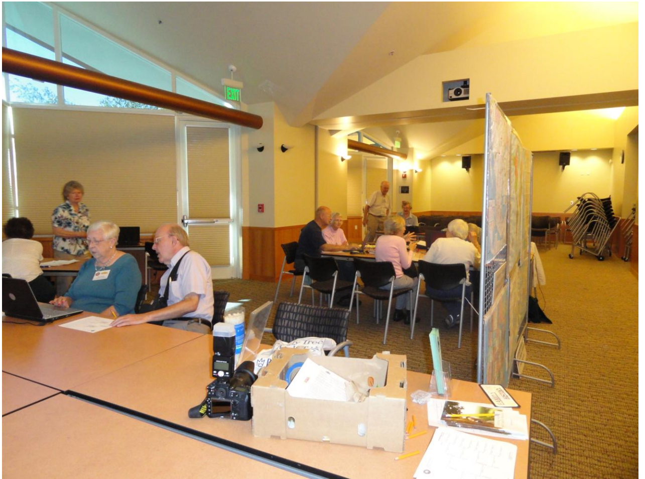
L-AGS at the Livermore Library