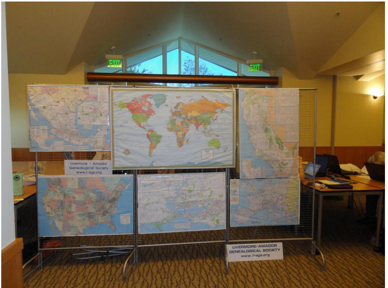
Where did you come from Livermore Library Event 2012